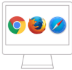
PC and Mac Chrome | Firefox | Safari